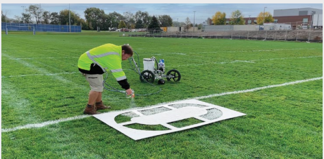
No-Tool Gun Removal for spraying stencils or large solid areas.